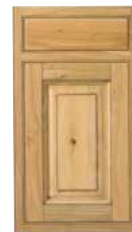
CHARACTER OAK ANTIQUED