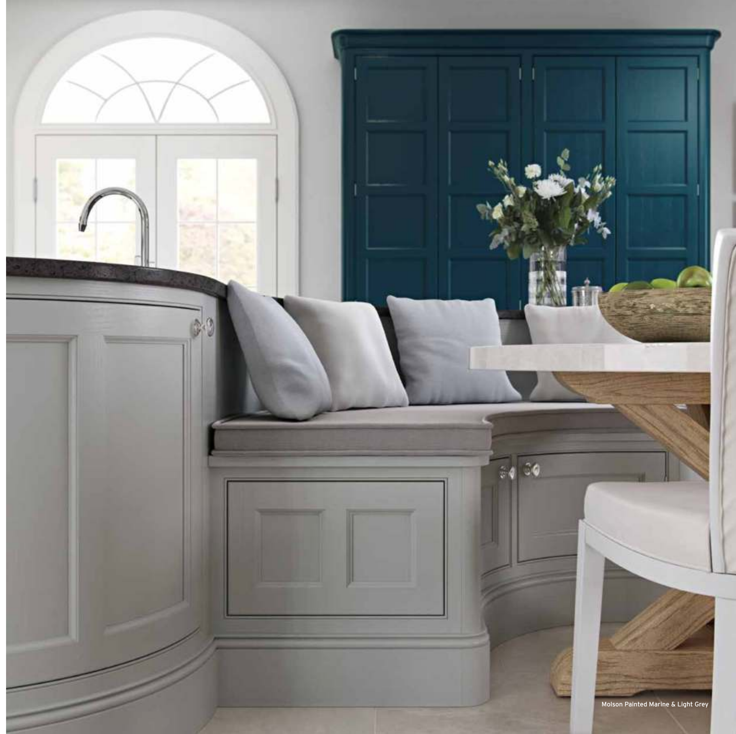
Molson Painted Marine & Light Grey

Here we showcase just a sample of what can be achieved in your home, allowing your imagination do the rest. Our desire is to create what you want without compromise, making your dream home a reality.