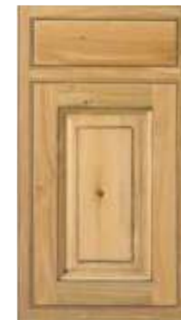
CHARACTER OAK ANTIQUED