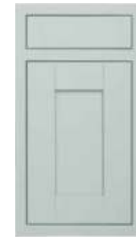
PAINTED LIGHT BLUE