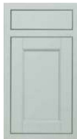
PAINTED LIGHT BLUE