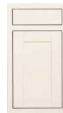
PAINTED WHITE COTTON