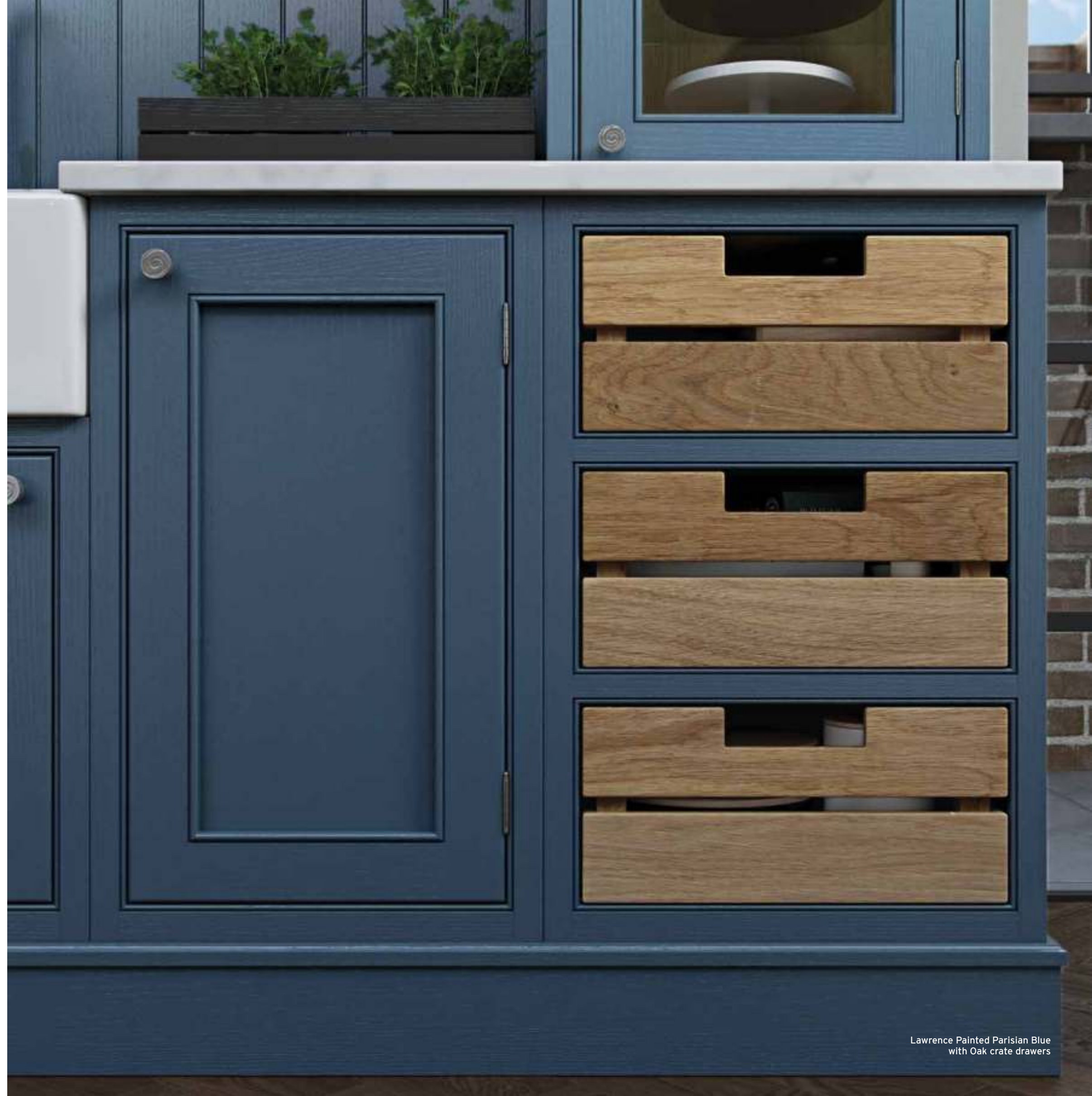
Lawrence Painted Parisian Blue with Oak crate drawers

Finally hinges, catches and handles are applied to provide the ultimate finishing touch.