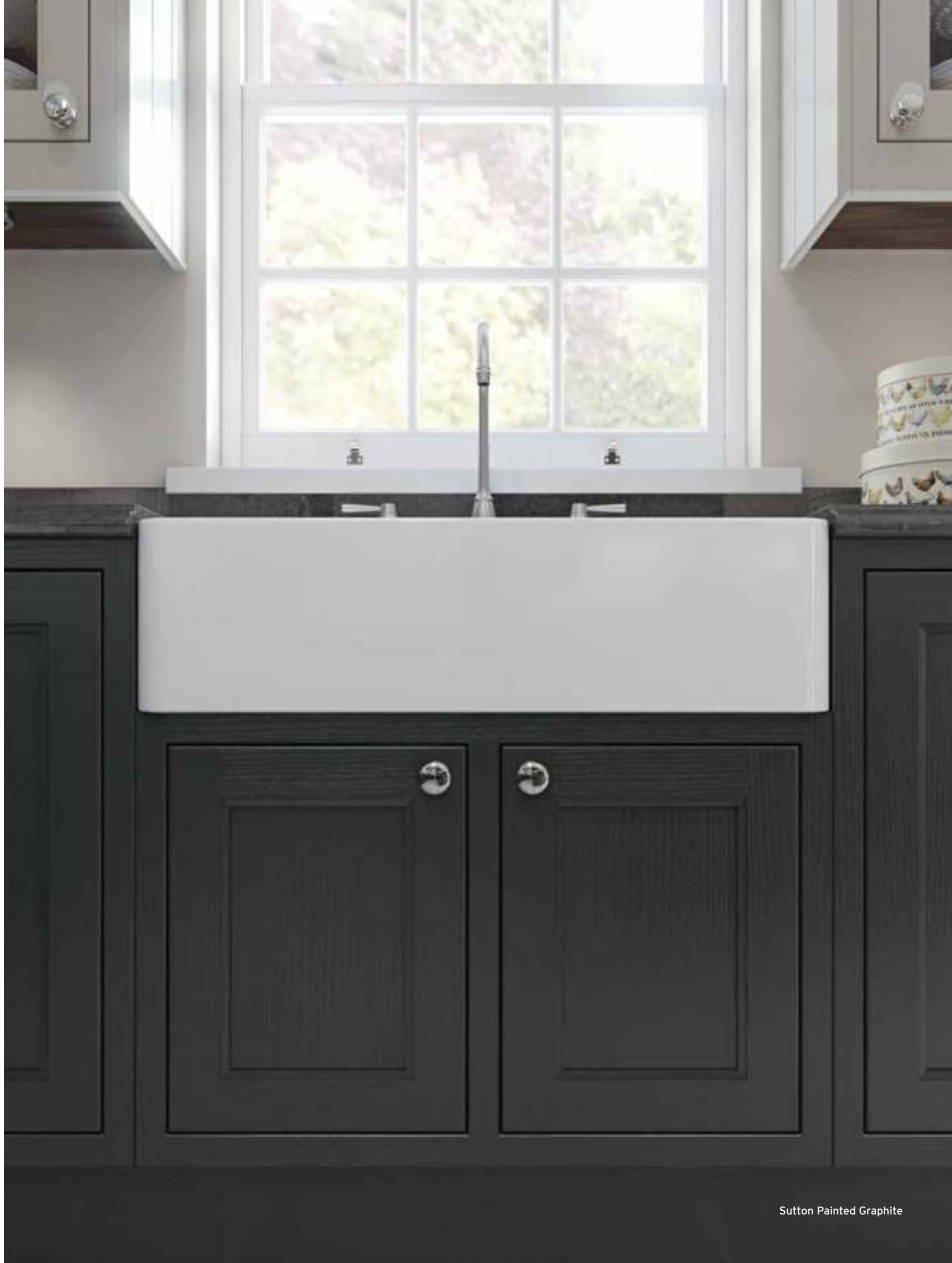
Sutton Painted Graphite