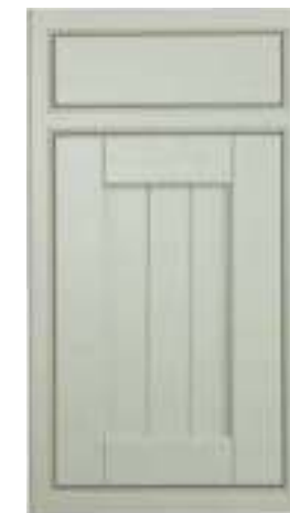
PAINTED SAGE GREEN