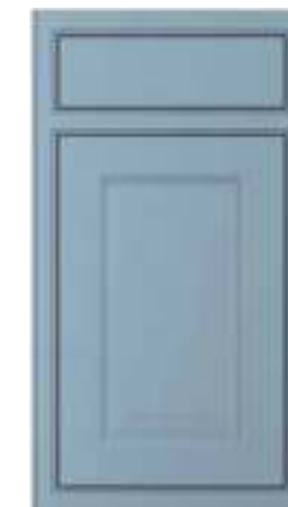
PAINTED SUMMER RAIN