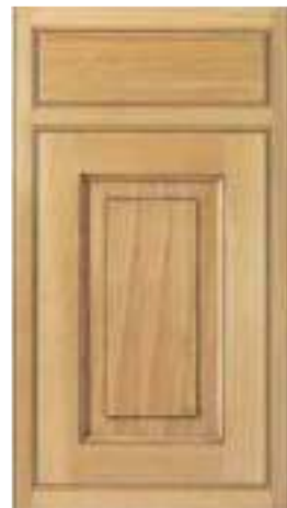
WHITE OAK ANTIQUED

The kitchen shown here features Yorkton Painted Suede (wall & base units, overmantle) with Yorkton Walnut (island, dresser, circular end tables, pull-out trays) and Walnut internal accessories.