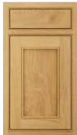
WHITE OAK ANTIQUED

The kitchen shown here features Lawrence Painted Brilliant White (wall & base units) and Parisian Blue (dresser & overmantle) with Oak island, crate drawers, dresser shelf and internal accessories.