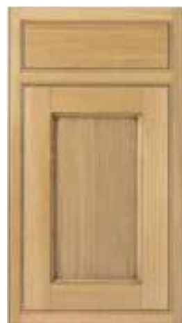
WHITE OAK ANTIQUED