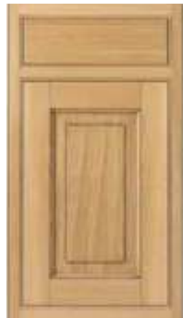
WHITE OAK ANTIQUED

The kitchen shown here features Toronto Painted White Cotton (wall & base units, island) and Light Blue (barrel unit, bench seating).