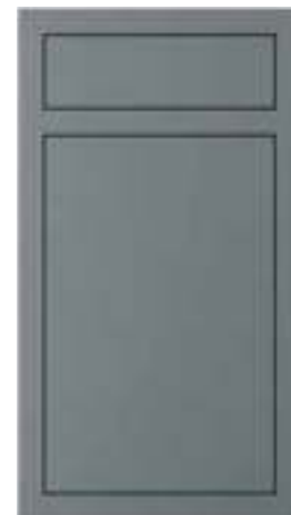
PAINTED DUST GREY