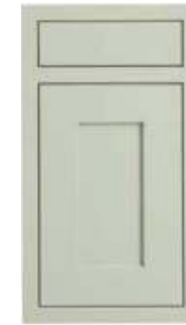
PAINTED SAGE GREEN