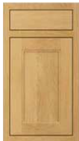
WHITE OAK ANTIQUED

The kitchen shown here features Sutton Painted Shell (wall units, barrel unit, overmantle), Graphite (base units, units above fridge freezer, island) and Sutton Walnut (mantle shelf, breakfast bar with corbals) and Walnut internal accessories.