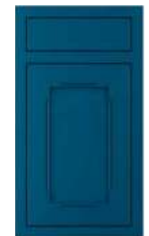
PAINTED PARISIAN BLUE