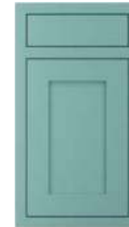
PAINTED LIGHT TEAL