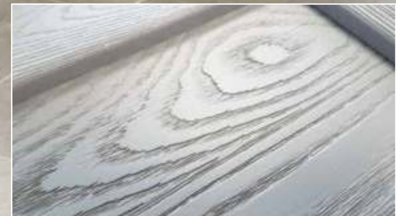
Deep grain detail on painted, sandblasted ash