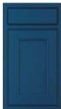
PAINTED PARISIAN BLUE