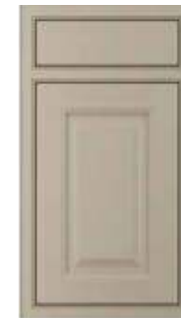
PAINTED STONE GREY