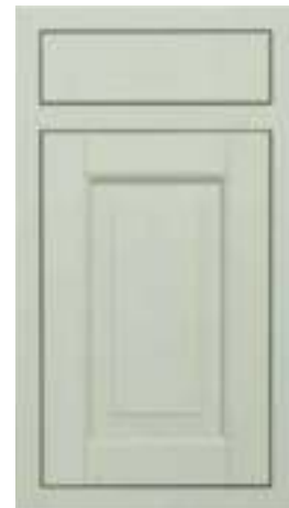
PAINTED SAGE GREEN