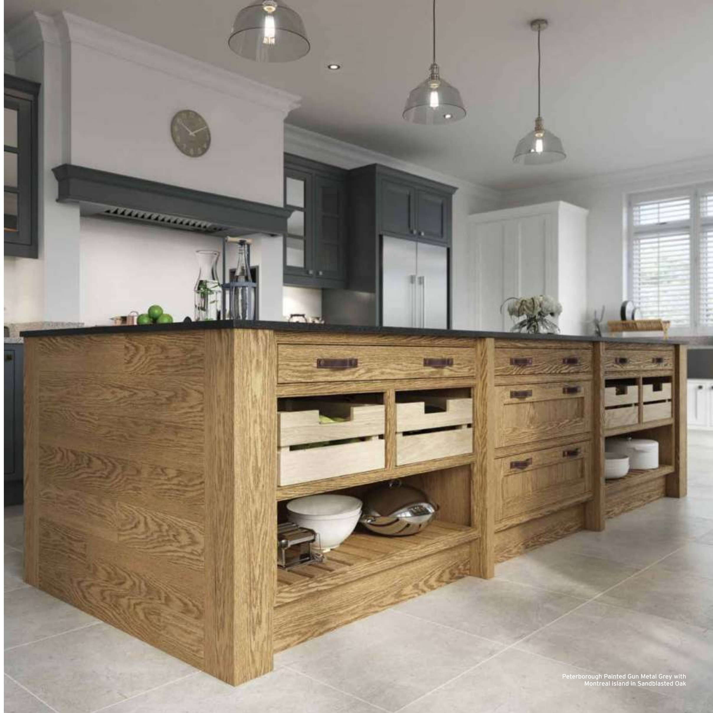
Peterborough Painted Gun Metal Grey with Montreal Island in Sandblasted Oak

Our vast selection of door styles and accompanying accessories are designed to inspire and excite you and, when combined with our specially sourced timbers and palette of paint finishes, you will have a home graced with furniture that is completely original, comprising the highest quality materials and craftsmanship.