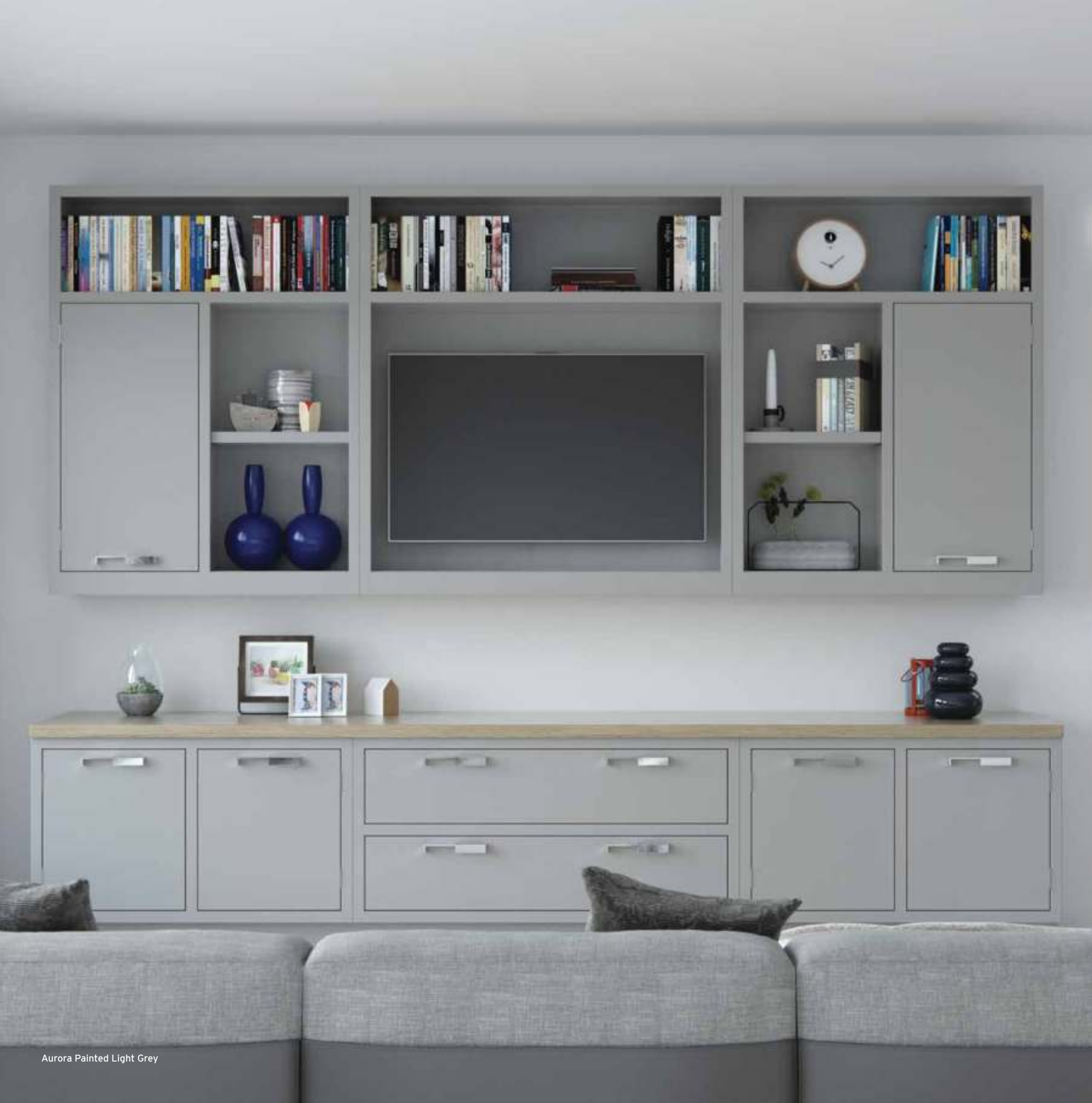
Aurora Painted Light Grey